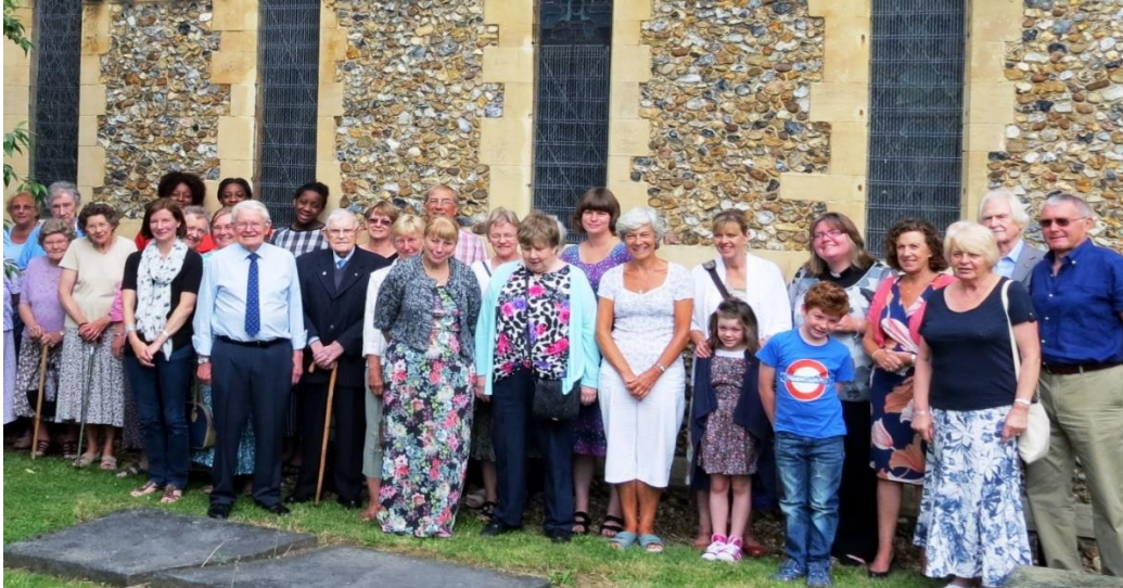
This picture was taken in 2014 – there have been a lot of changes since then!